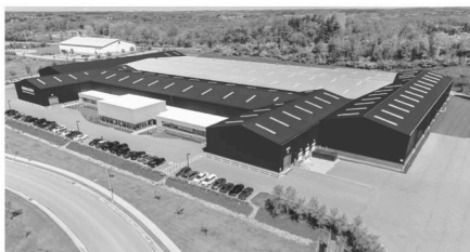
Burgettstown, PA - High Performance Doors

As one of the world's leading manufacturers of doors we're committed to providing the best quality, value, and selection. Whether residential, commercial or industrial, we have the door you're looking for. Each Hörmann product gives you the perfect array of benefits and options to satisfy your customers.