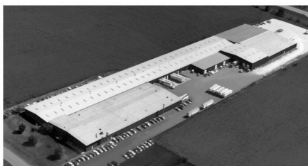
Montgomery, IL - Sectional Doors