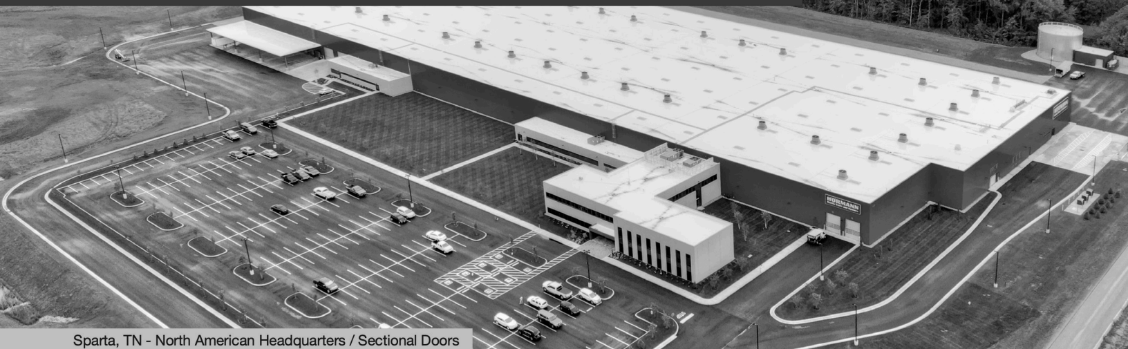
Sparta, TN - North American Headquarters / Sectional Doors