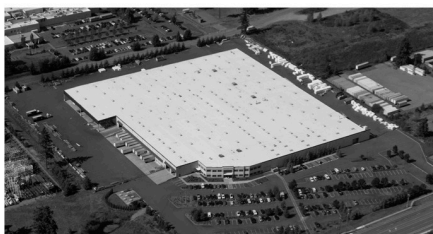
Puyallup, WA - Sectional Doors