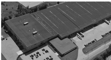
Barrie, ON (CAN) - High Performance Doors