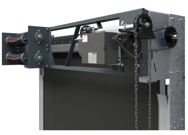
MODEL HD-SD 3050 High-speed, spring counterbalanced, chain drive system