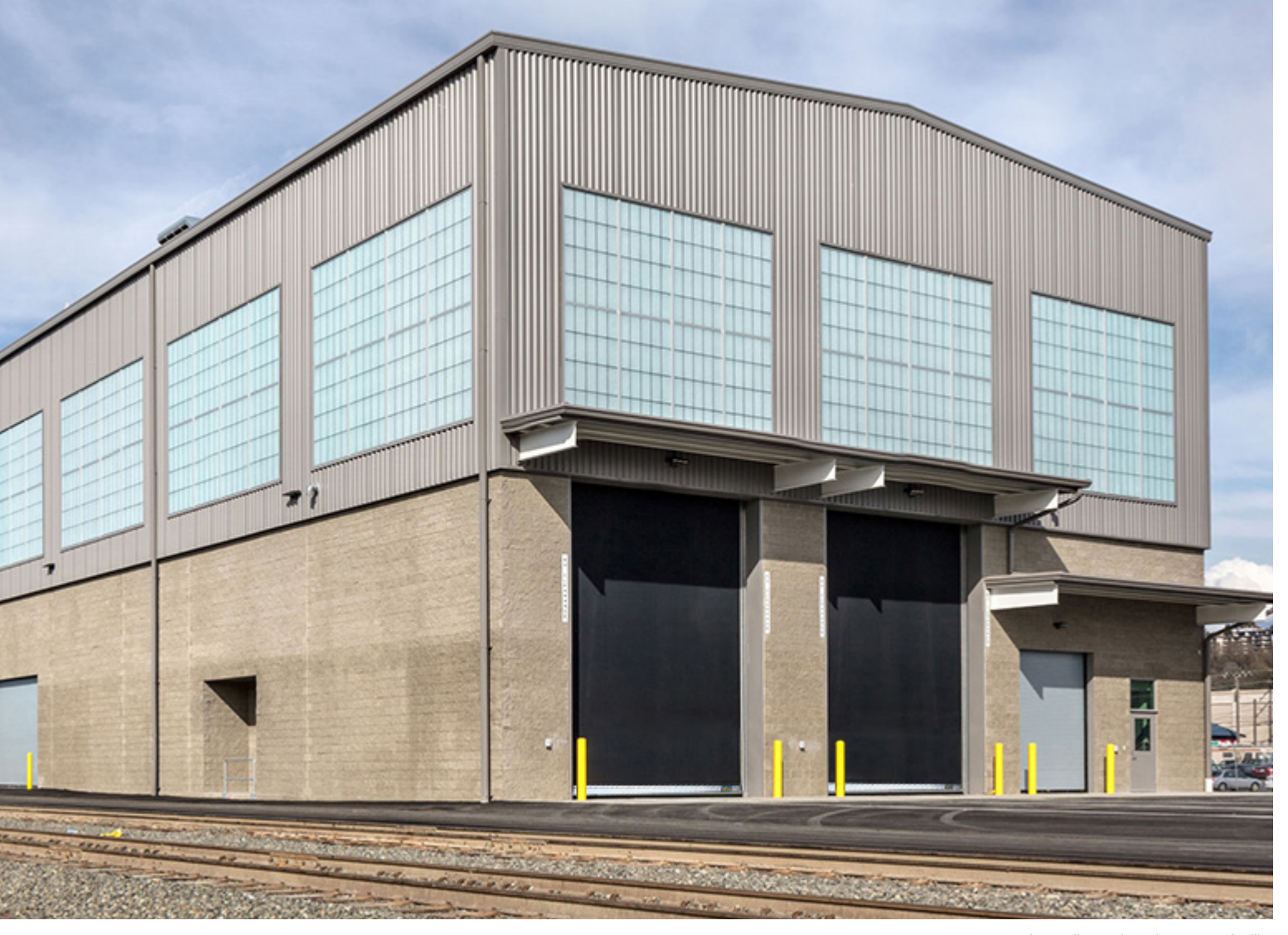
MODEL HD-DD 3065 in a rail transit maintenance facility

HD SERIES Direct Drive models include three models that meet a wide range of needs and budgets: the HD-DD 3065 rubber door and it's low headroom option, HD-DD 2555, and the HD-HD 2565 hybrid door. The HD-DD 3065 and the HD-DD 2555 offer the full heavy duty rubber door design for harsh, demanding environments with the HD-DD 2555 fitting into as little as 20 inches headroom. The HD-HD 2565 offers a hybrid alternative of a lighter rubber curtain or 88 ounce fabric curtain. These provide speed and durability for less demanding environments while maintaining all the benefits of Hörmann's direct drive system.