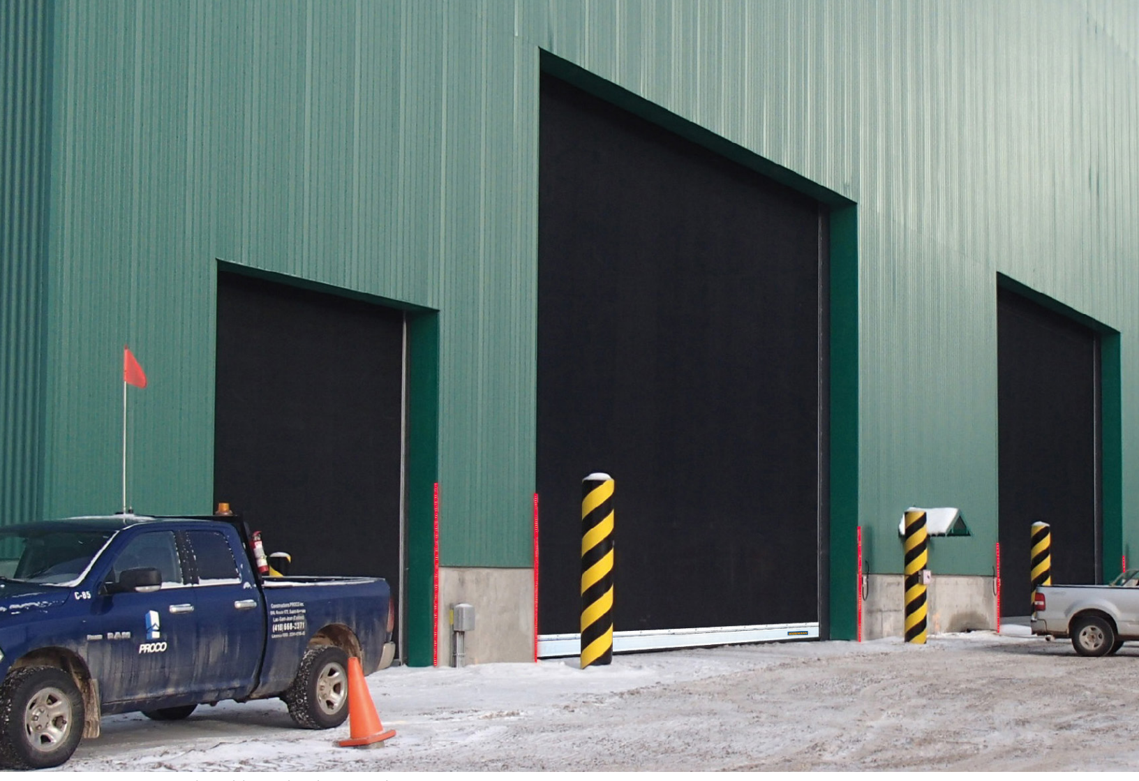
MODEL HD-CD 3025 in a mining truck maintenance shop