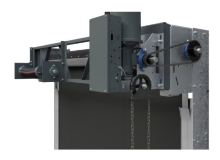
MODEL HD-SD 3020 Economy, spring counterbalanced, chain drive system