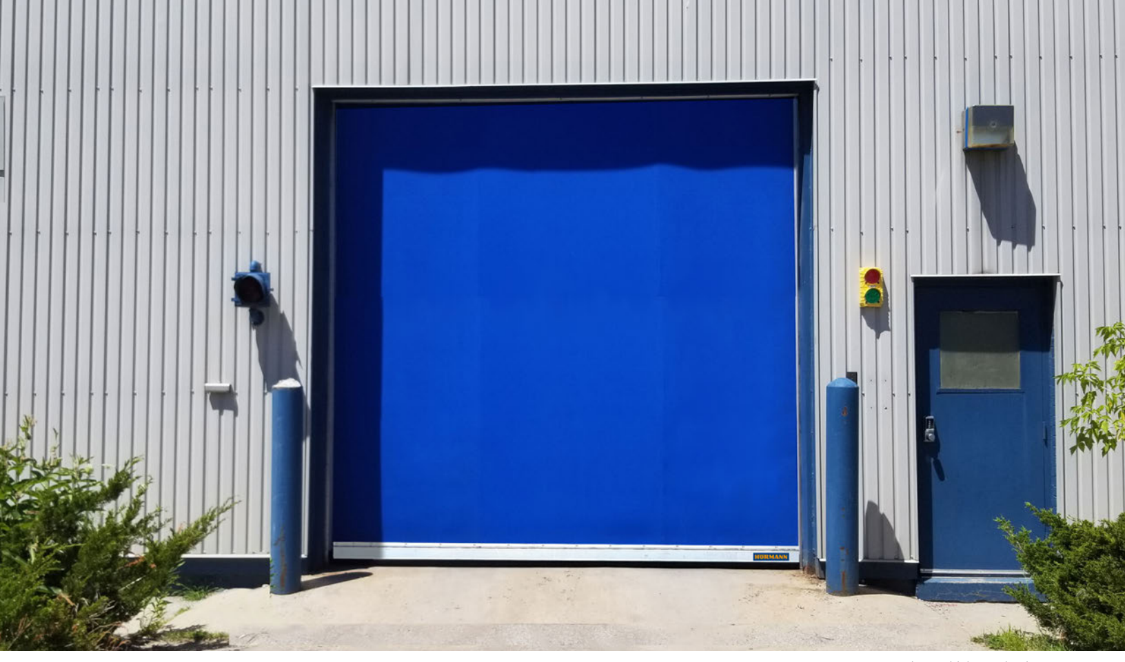
MODEL HD-SD 3020 in a vehicle service bay

THE HD-SD 3050 operator is controlled by a programmable logic controller with a variable frequency drive in a NEMA 4 enclosure for precision control and durability. The HD-SD 3020 uses relay logic and contactors in a NEMA 1 operator mounted control box (OMC). Upgraded controller options are available for a wide range of applications covered by these versatile doors.