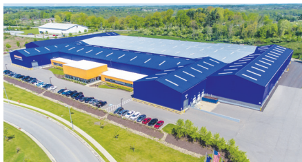
Burgettstown, PA - High Performance Doors

As one of the world's leading manufacturers of doors we're committed to providing the best quality, value, and selection. Whether residential, commercial or industrial, we have the door you're looking for. Each Hörmann product gives you the perfect array of benefits and options to satisfy your customers.