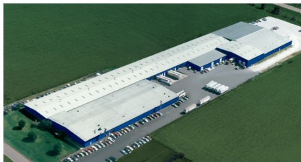
Montgomery, IL - Sectional Doors