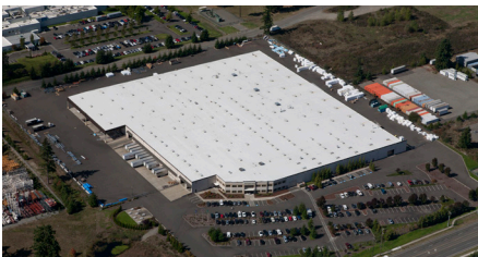
Puyallup, WA - Sectional Doors