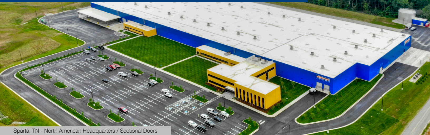
Sparta, TN - North American Headquarters / Sectional Doors