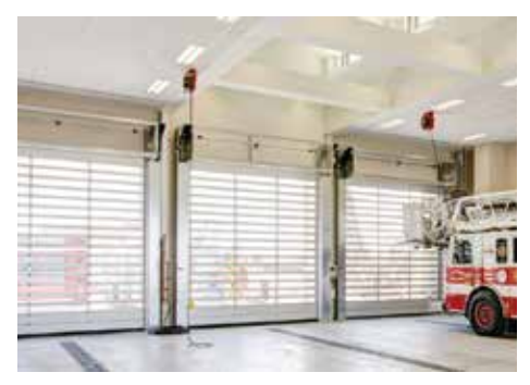
The Speed-Guardian™ Coiling Complete View high speed, secure line of doors provide excellent visibility, attractive design, and fast opening speeds.