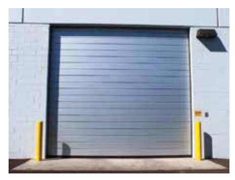
Hörmann Speed-Guardian™ Hurricane-Rated doors provide excellent wind resistance capabilities and fast opening speeds.