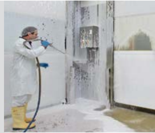
Optional one-piece panel shown