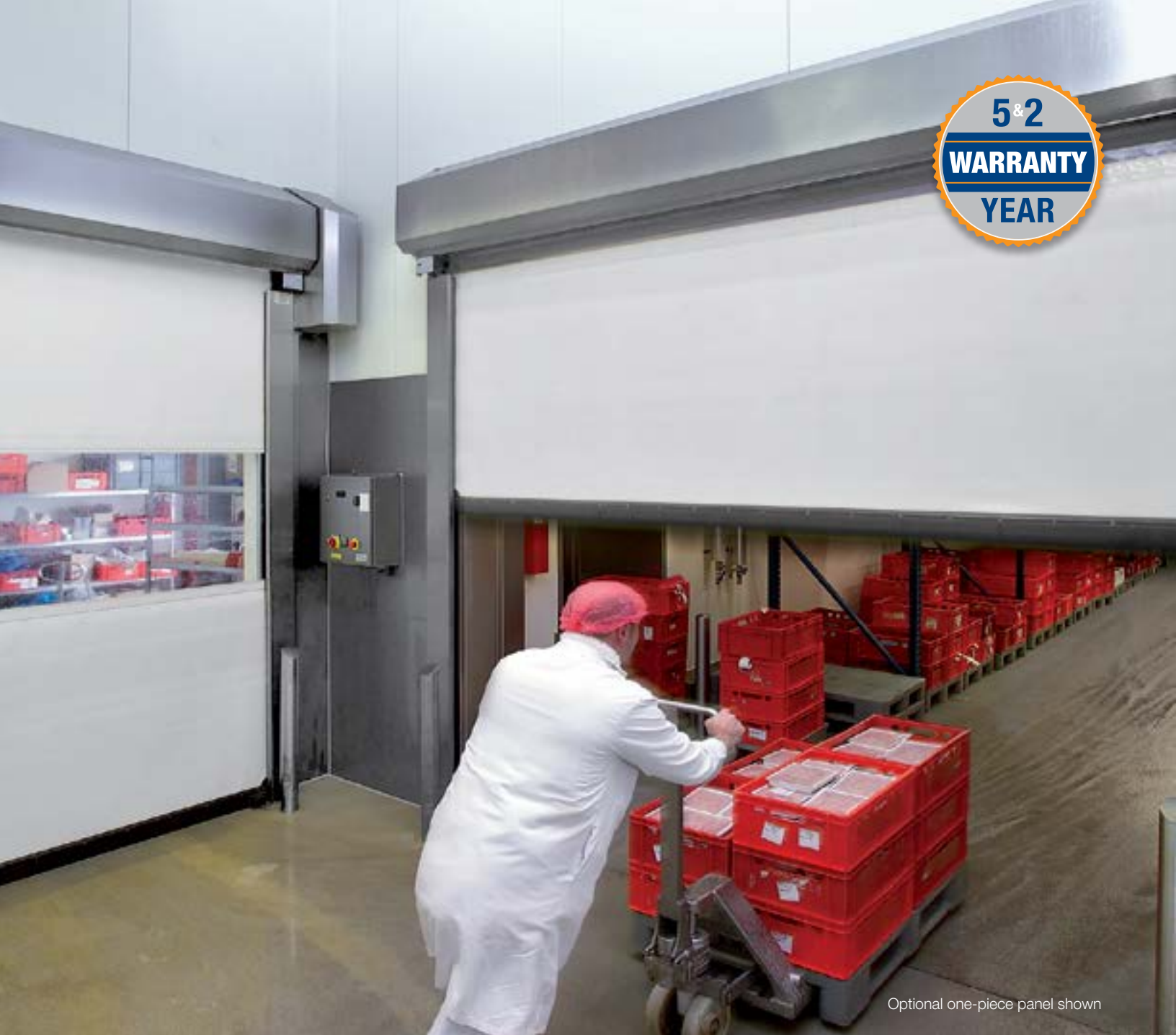
Optional one-piece panel shown