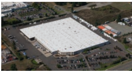
Puyallup, WA - Sectional Doors