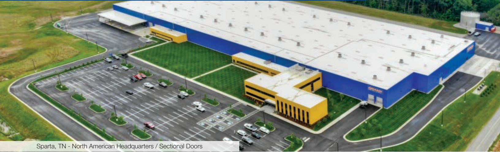
Sparta, TN - North American Headquarters / Sectional Doors