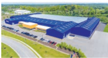
Burgettstown, PA - High Performance Doors

As one of the world's leading manufacturers of doors we're committed to providing the best quality, value, and selection. Whether residential, commercial or industrial, we have the door you're looking for. Each Hörmann product gives you the perfect array of benefits and options to satisfy your customers.