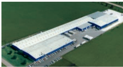
Montgomery, IL - Sectional Doors