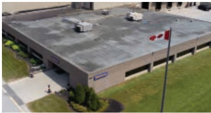
Barrie, ON Canada - High Performance Doors