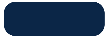
Sapphire Blue* RAL 5003

All colors shown as accurately as printing technology allows and may vary slightly from this chart. If you have any questions please feel free to contact Hörmann Technical Customer Service at (630) 299-4219.