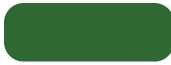
Leaf Green* RAL 6002