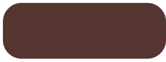
Mahogany Brown* RAL 8016